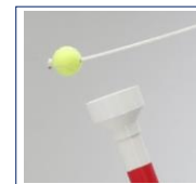
Put it In.

| The Orbiter is similar to the executive gift Newton's Cradle in that they are both pendulum devices, used to demonstrate the laws of motion, and to serve a decorative function for the home and office. Newton's Cradle and the Orbiter are part of a group of toys known as "art in motion toys".