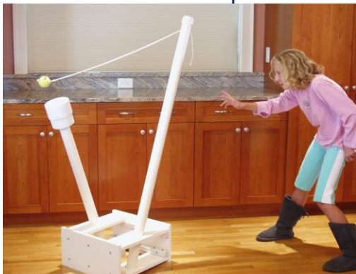
Best of Eleven / Most in a Row