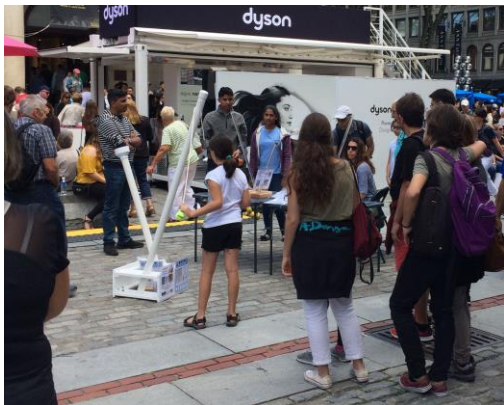
It's in the cup!