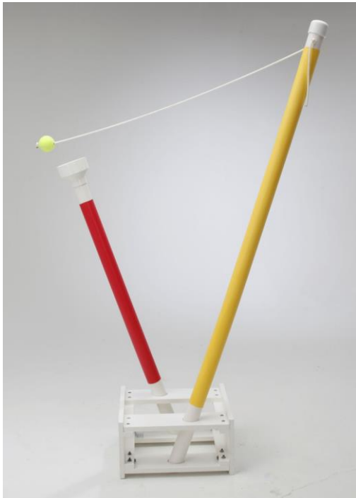
White Base Color Posts – 6' Tall -